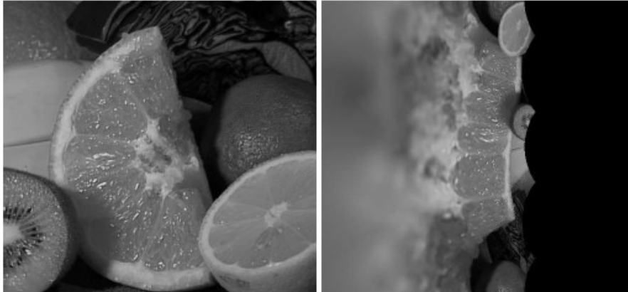
Figure 1: Log-polar transformation: before and after